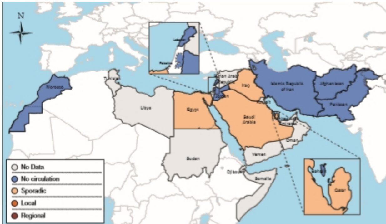
Fig. 1. Influenza geographic spread in Eastern Mediterranean Region, July 2018 Influenza activity by subtype

In the WHO Eastern Mediterranean Region, influenza activity continue to decrease in the month of July in many countries reporting data to FluNet and EMFLU namely, Afghanistan, Bahrain, Egypt, Iran (Islamic Republic of), Iraq, Jordan, Lebanon, Morocco, occupied Palestinian territory, Pakistan, Qatar and Saudi Arabia.