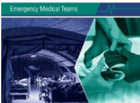
Minimum technical standards and recommendations for rehabilitation in emergency medical