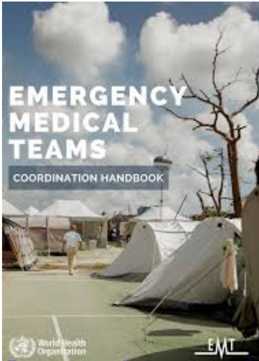
Emergency medical teams: coordination handbook