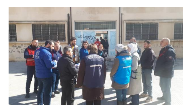
Joint Intersectoral visit to shelter in Hama.

As of 11:00, 10 February 2023, 2326 injuries and 1387 deaths have been recorded in the governorates of Aleppo, Latakia, Hama, and Tartous, with additional reports expected as search and rescue efforts continue. So far, 31 health workers have reportedly died – 16 doctors and 15 pharmacists. The greatest number of injuries were reported from Aleppo, Latakia, and Hama.