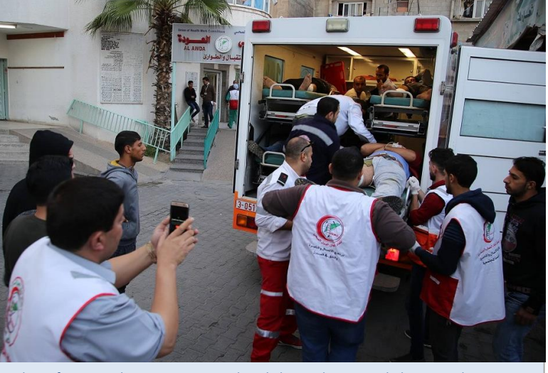
Photo: four injured patients arrive to Al Awda hospital in one ambulance.