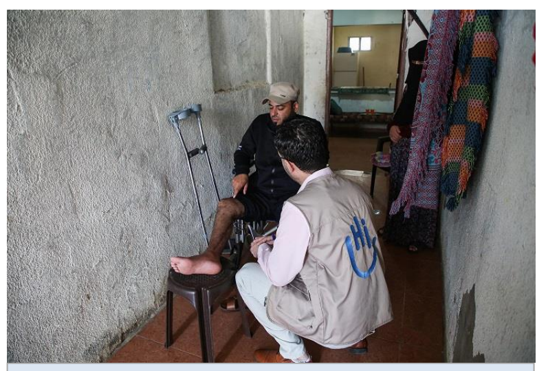
Photo: HI team interviewed PwI to identify his needs in terms of referral.