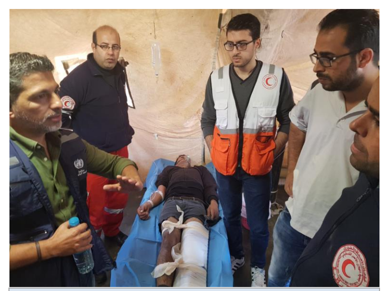
Photo: WHO provided clinical coaching at the TSP in Gaza.

WHO conducted a clinical coaching mission to the Trauma Stabilization Point in Malaka, Gaza. This was part of WHO's broader activities in upgrading the TSP capacity across the Gaza Strip.