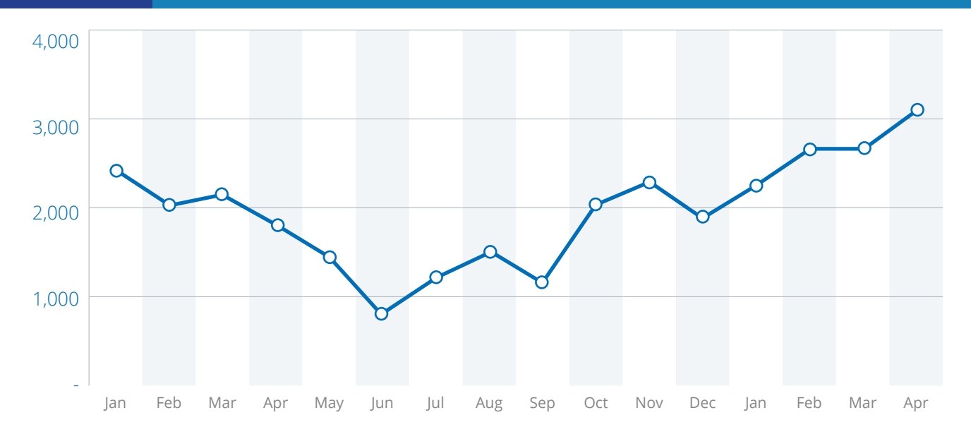
Chart 1: Total number of referrals approved for Gaza patients, Jan 2017 - April 2018

approved for financial coverage for Gaza patients outside the Palestinian Ministry of Health