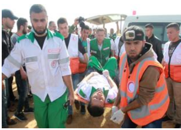
4 paramedics were injured on the 6<sup>th</sup> April.

• 29 healthcare staff suffered from tear gas inhalation