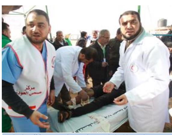
Medical staff from NGO hospitals provided additional support