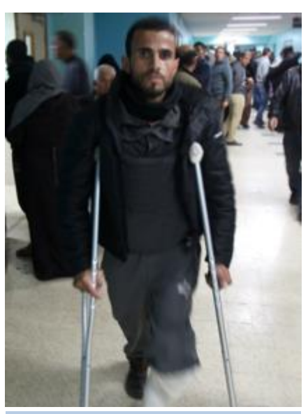
The ICRC donated 245 items of adaptive devices, including crutches, walking frames and wheel chairs