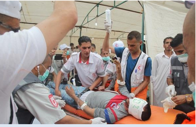
Description: an injured young man receives treatment at the TSP

An additional 276 injuries were managed and discharged at the 10 trauma stabilization points (TSP) and primary healthcare centers. These TSPs are led by the MoH, and supported by the Palestinian Red Crescent Society (PRCS), and the Union Health Workers Committee (UHWC).