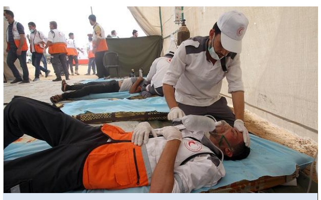
Description: A health worker suffers from gas inhalation.

workers affected, 25 suffered injuries from live ammunition, of whom two were killed, 23 were hit directly with tear gas canisters and 11 were hit by shrapnel. These total numbers include additional data provided for the Palestinian Civil Defense medical teams and Palestinian military medical services.