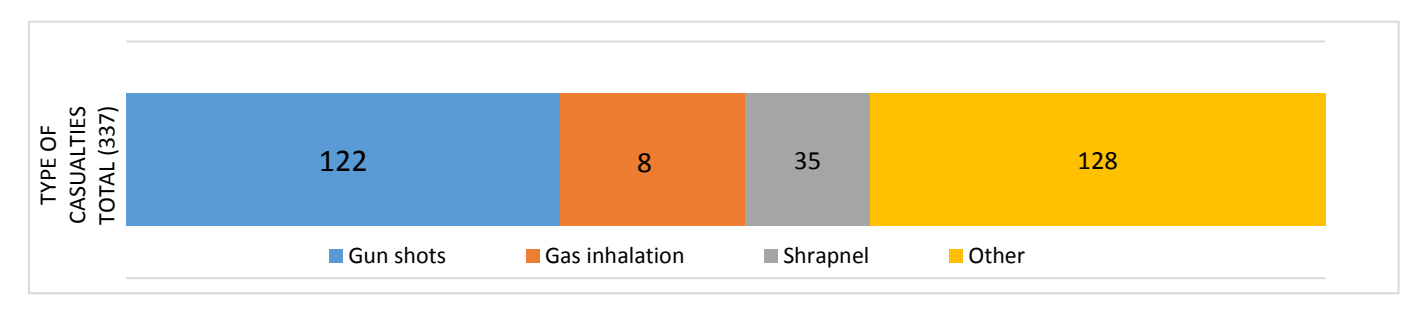
Type of casualties treated at the Ministry of Health and NGO hospitals<sup>2</sup>

An additional 364 injuries were managed at primary healthcare centers and 10 trauma stabilization points (TSP) and discharged. These TSPs and primary healthcare facilities offering frontline care are led by the MoH, and supported by the Palestinian Red Crescent Society (PRCS), and receive support of the Union Health Workers Committee (UHWC) NGO.