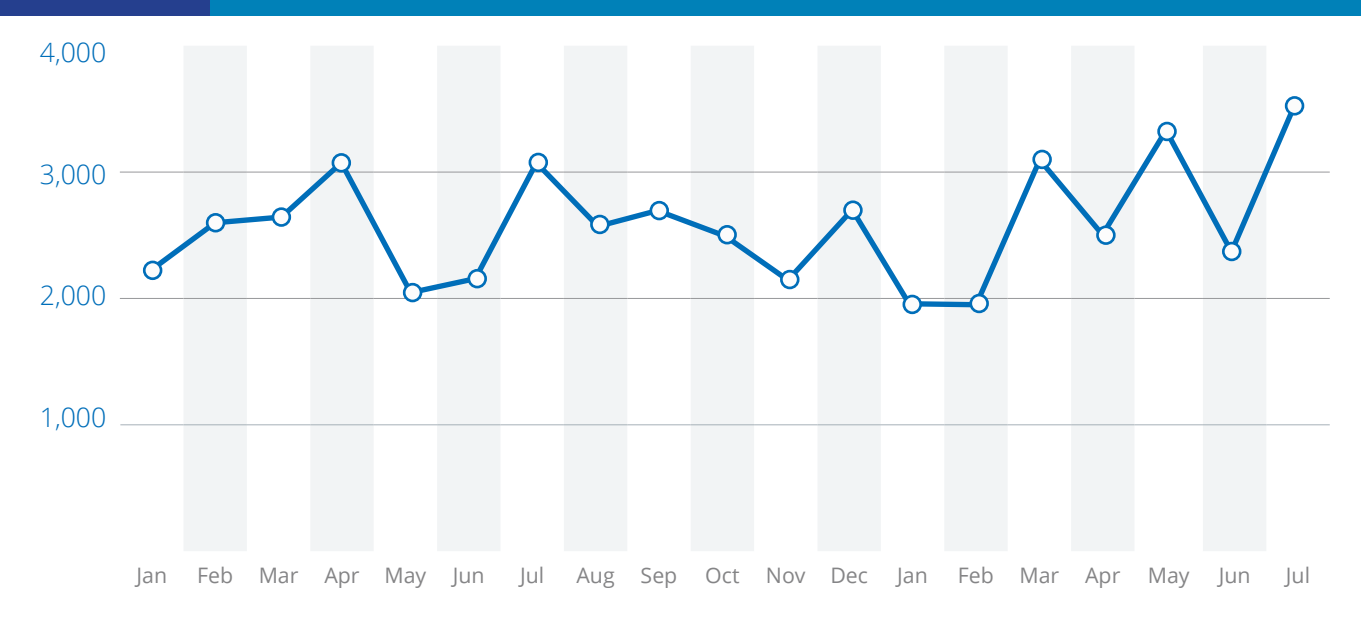
Chart 1: Total number of referrals approved for Gaza patients, January 2018 - July 2019

referrals approved for financial coverage for healthcare outside the Palestinian Ministry of Health