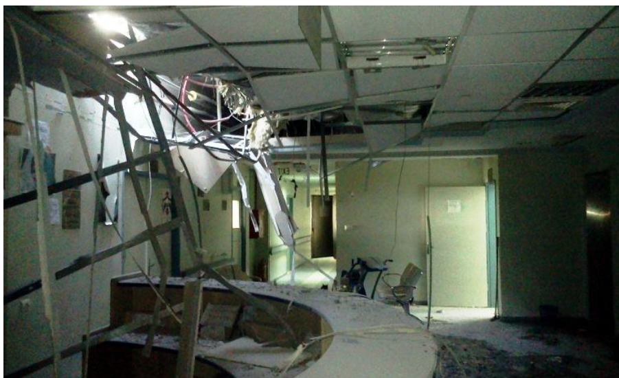
The Jordanian Field Hospital, in-patient area

The EMS reported that 3 ambulance drivers were injured during the war. In addition, 6 ambulances were damaged: 4 ambulances were damaged by shrapnel, (2 were severely damaged and two had minor damage) and 2 ambulances were involved in accidents while transferring casualties.