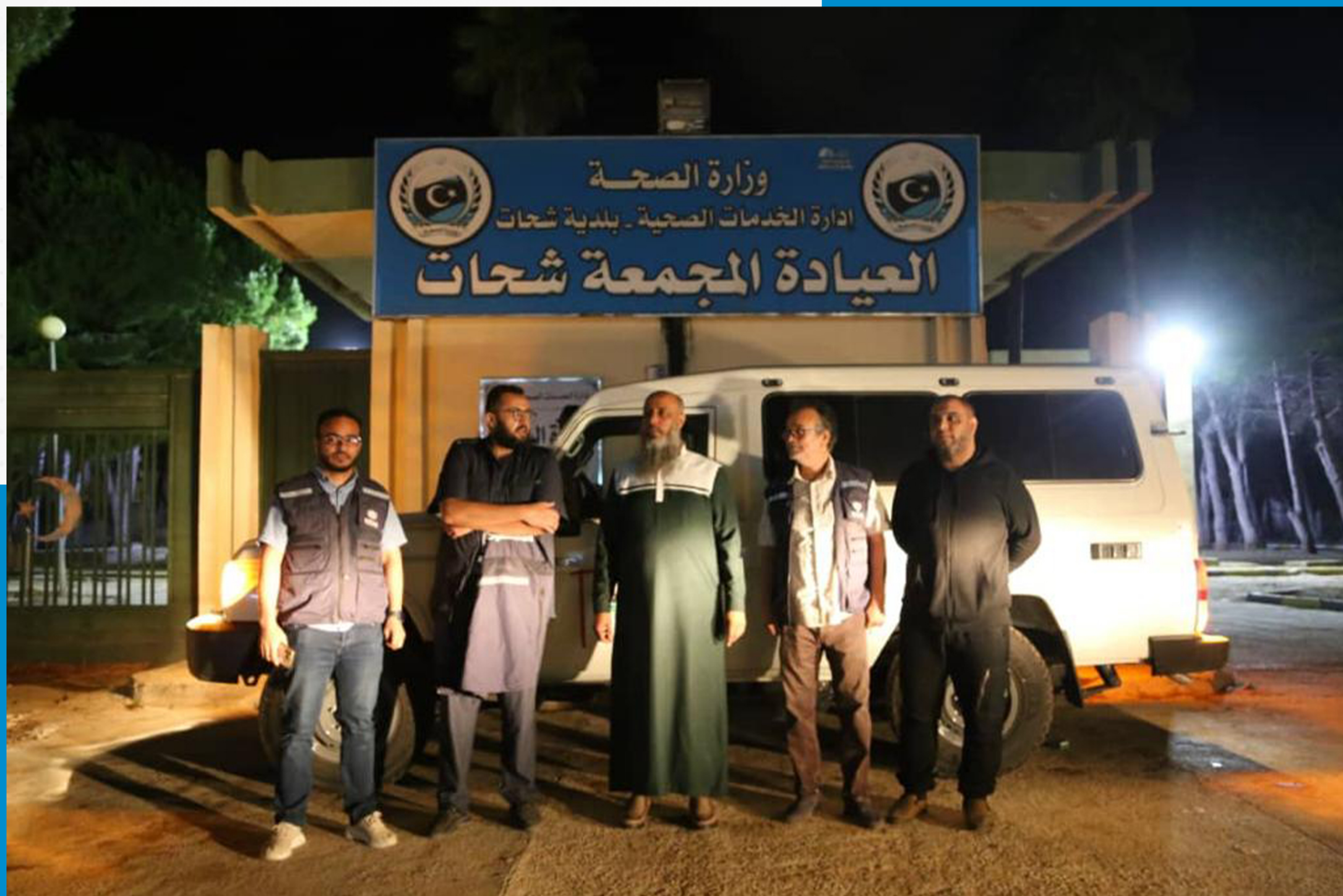
A team from WHO conducted an assessment mission to the affected health facilities in shahat directorate and handed over an ambulance to support the referral