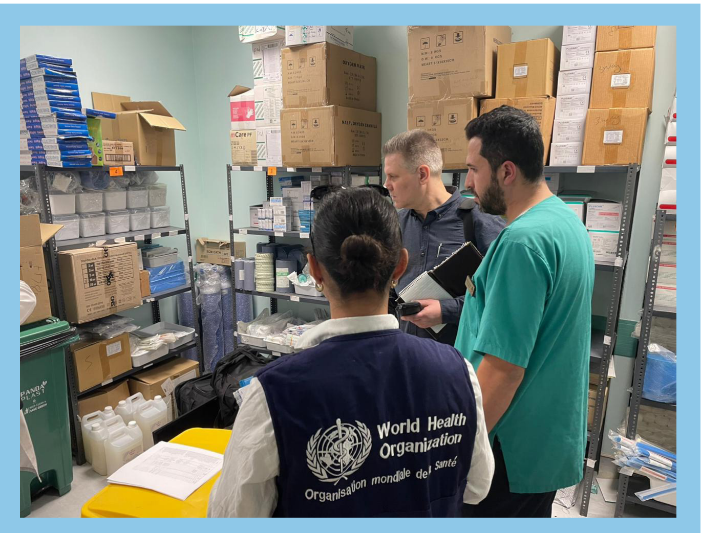
WHO visited Nabatiyeh Governmental Hospital on 9 November 2023 to check the readiness level to receive casualties, based on the trainings and the stock of advanced trauma supplies they received, along with available contingency plan.