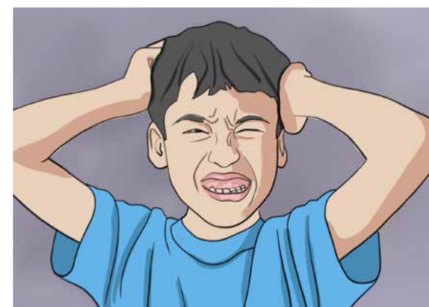
8–10% of people develop severe symptoms, including eye disease, excessive bleeding, and swelling of the brain