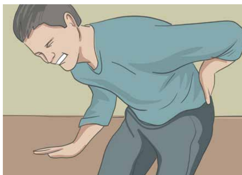
Mild illness with fever, weakness, back pain and dizziness