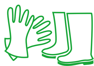
Avoiding direct contact with blood, bodily fluids or tissues of animals