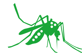
Protecting yourself from mosquito and insect bites