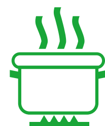
Cooking raw meat and milk thoroughly