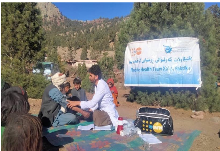
Provision of primary healthcare services to the returnees in Paktika province (OHPM)