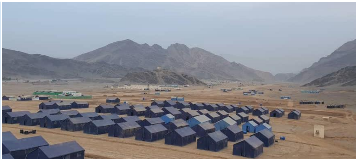
Returnees' Camp in Torkham, Nangarhar Province, Afghanistan.

WHO has requested US$ 10 million for six months . To date, only a paltry US$ 500,000 has been received, leaving a funding gap of US$ 9.5 million