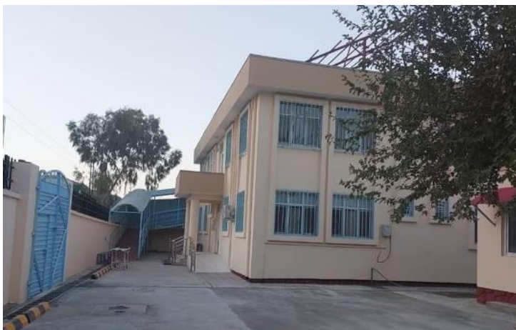
WHO has established a 20-bed emergency hospital located in Torkham in collaboration with WORLD, 1.5km away from Torkham PoE.