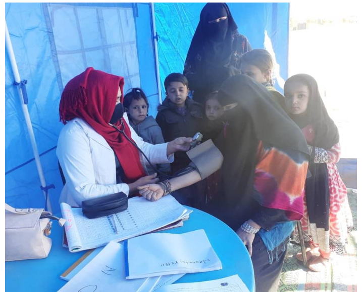
Female healthcare workers providing reproductive maternal, newborn and child health services for the returnees in Ghazni province.