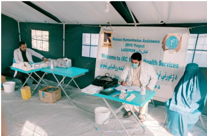
Provision of primary health care services to the returnees in Eastern Region (IRC)