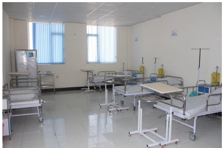
WHO-supported 30-bed emergency hospital in Spin Boldak was inaugurated on 21 November.