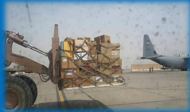
WHO Essential Medical Supplies airlifted to Haditha and Al Baghdadi Cities through Al Asad Airbase in Anbar Governorate, August 2015.