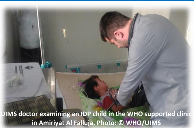
UIMS doctor examining an IDP child in the WHO supported clinic in Amiriya at Al Falluja.