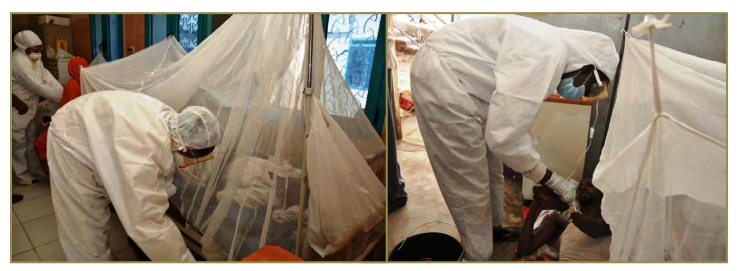
Most suspected yellow fever patients being treated at the isolation wards of Nyala Teaching Hospital in South Darfur's capital are from Central Darfur.