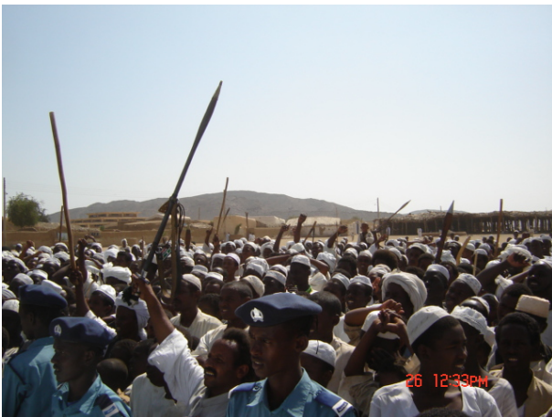
Hamesh-Korieb community welcomed the visiting delegation—representatives from MOH, IRC and WHO

Hamesh Korieb has a hospital which was built during Nimeri's regime and subsequently taken -over by the army. It was managed by Samarth, an American NGO based in Chicago. They pulled-out when the East peace agreement was signed in 2006. During the visit, the Army is supporting the male ward of the hospital. The hospital is in need of laboratory equipment and medical supplies.