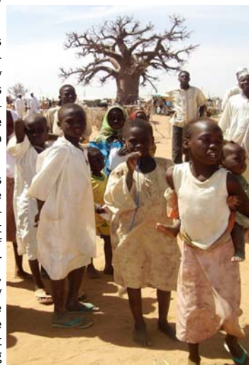
Children of Nyala, South Darfur