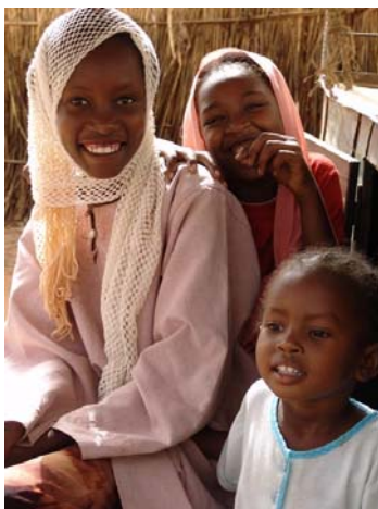
At the El Fasher Feeding Centre in North Darfur