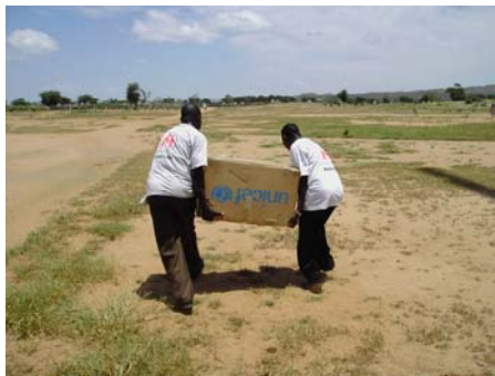
MEDIAIR drug supplies distribution

As well as treating common illnesses, the team also implements an immunization program assisted by staff from the Ministry of Health