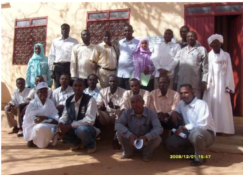
Pic above: Participants of the HIMS training in El Fasher.

WHO supported SMOH in training of 25 PHC supervisors from SMOH and INGO's on Health Information Management system (HIMS), in North Darfur the training is concluded with recommendations from Participants to continue on similar trainings to improve the capacity of PHC supervisors In West Darfur 22 participants from SMOH and different NGOs were trained in Geneina on routine laboratory investigations .