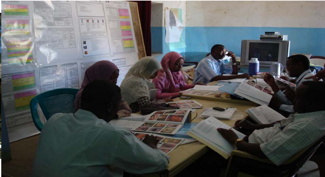
Classroom session training of MA in North Darfur

W est Darfur, - WHO has supported 2 major trainings for different cadres of health staff .