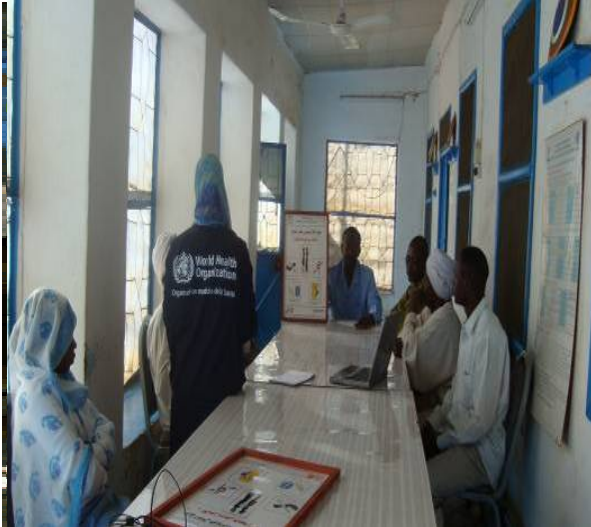
Pic: Shows WHO PHC officer offering awareness session to fellow colleagues in the Sub Office Geneina.