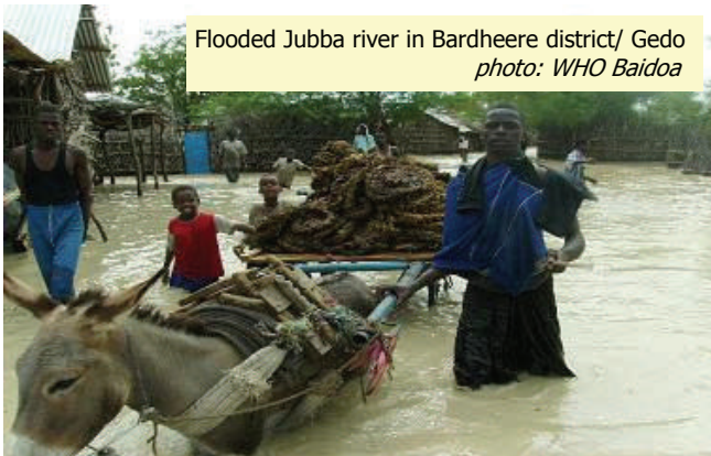
Flooded Jubba river in Bardheere district/ Gedo