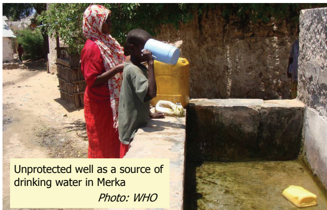
Unprotected well as a source of drinking water in Merka