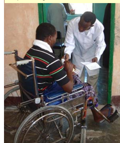
Free treatment campaign in Ex Martini hospital, Mogadishu