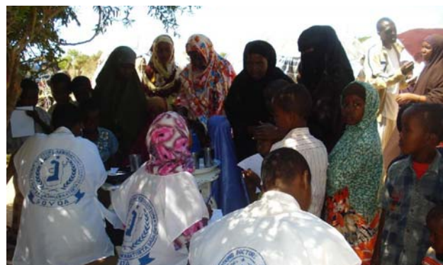
SOYDA's "free consultation and treatment campaign" in km13 on Afgoyee corridor (Lower Shabelle)

goyee corridor (Lower Shabelle) where more than 1,600 internally displaced families live. The preceding health assessment found overcrowding; poor personal and environmental hygiene; lack of drinking water; lack of health care and public services. During the campaign, 559 patients (of them 38% women and 33% children under 5 years of age) were examined. The three leading causes of morbidity were skin infections (95 cases of which 67% patients 5 years or older) including eczema, scabies, impetigo; respiratory infections (83 cases) including bronchitis, pneumonia, common cold, and otitis; and intestinal parasites (71 cases of which 65% children under 5 years of age) including giardiasis, ascariasis, schistosomiasis.