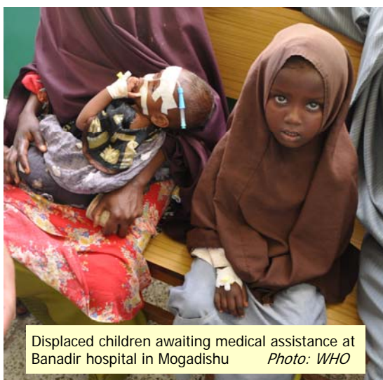
Displaced children awaiting medical assistance at Banadir hospital in Mogadishu