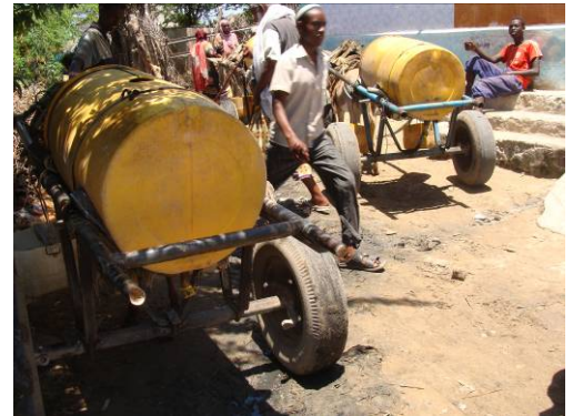
Water being transported by donkey carts in Merka town