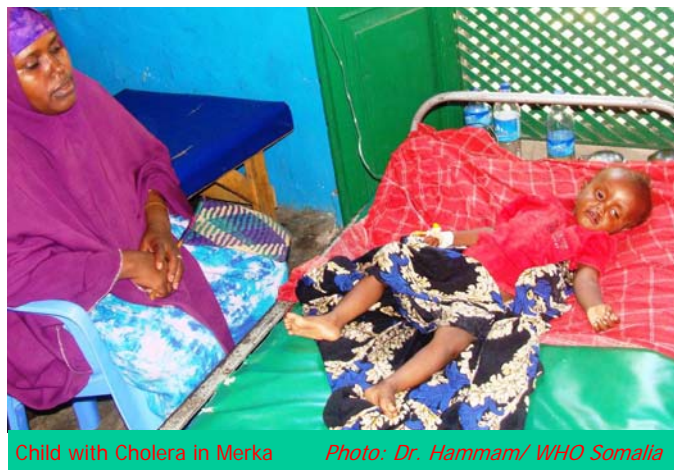
Child with Cholera in Merka