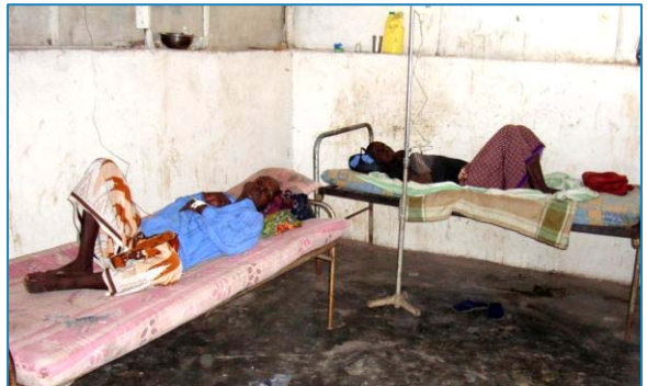
Patients recovering at the Habeeb CTC

Response to the current alert: WHO provided an assortment of AWD case management supplies to the Habeeb CTC as part of the initial response including 400 litres of ringer lactate and accessories and antibiotics (Erythromycine syrup, tablets and Doxycillin). WHO team also collected stool samples from new admissions which have been sent to the KEMRI laboratory in Nairobi for culture. This will guide response activities. Results of samples are due this week.