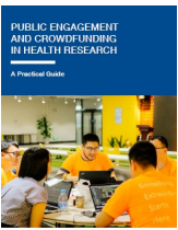
Public engagement and crowdfunding in health research: a practical guide