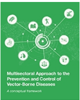
Multisectoral approach for the prevention and control of vector-borne diseases: a conceptual framework