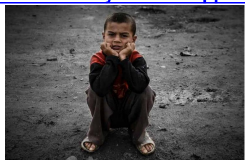
WHO Emergency Appeal 2022