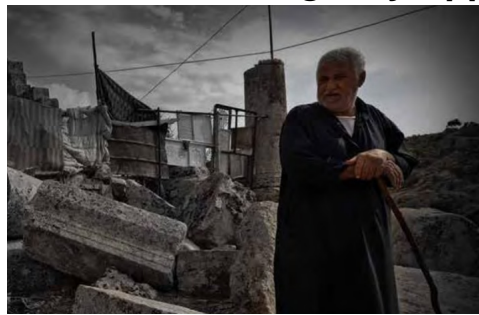
Northeast Syria flash appeal 2022