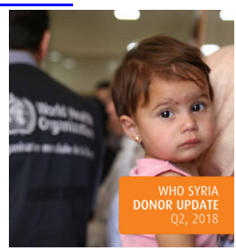
World Health Organization