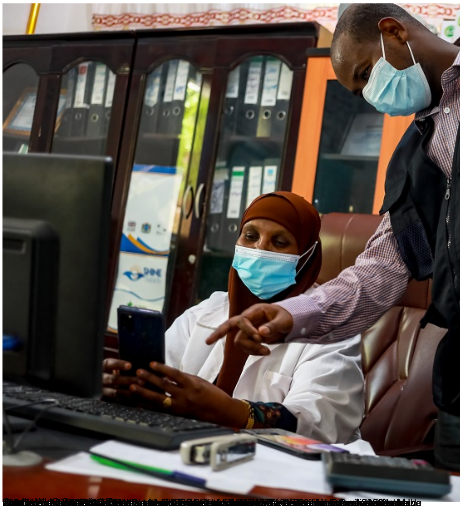
Rapid response teams collect and facilitate testing of COVID-19 samples

Of the 113 alerts made, Somalia worked on a verification process for samples from 47 suspected cases as they did not meet the COVID-19 case definition. With the support of WHO, the FCDO and Federal Ministry of Health, through well-trained district polio officers and district