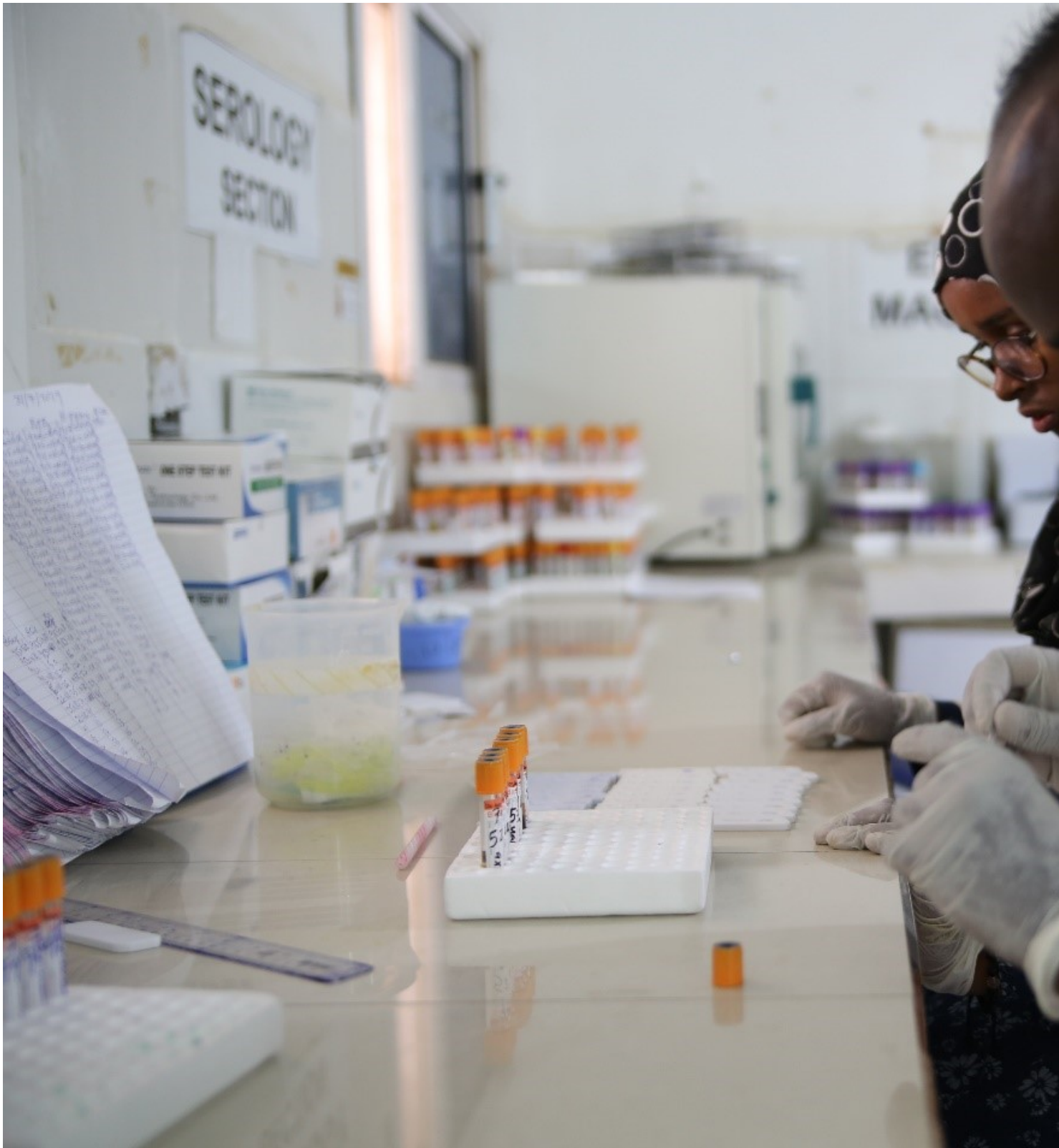
Laboratory workers conduct blood testing in Hargeisa, Somaliland.