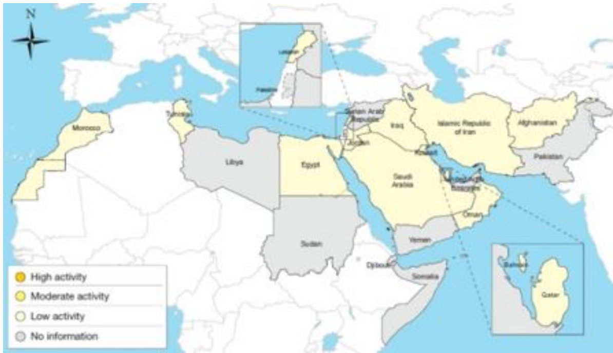
Fig. 1. Influenza activity in the Eastern Mediterranean Region, May 2017 Influenza activity by sub-type

In the WHO Eastern Mediterranean Region, influenza activity remained low in May in countries reporting data to FluNet and EMFLU namely, Afghanistan, Bahrain, Egypt, Iran (Islamic Republic of), Iraq, Jordan, Morocco, Oman, Qatar, Saudi Arabia, and Tunisia (Fig. 1). All seasonal influenza subtypes were detected in the Region.