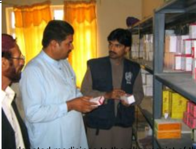
The WHO pharmacist gives guidance on donated medicines to the pharmacist of the TB