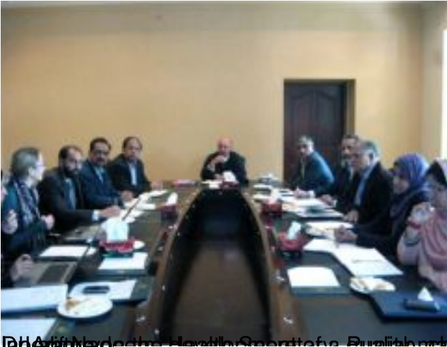
DHA officials and WHO staff meeting to discuss the implementation of the essential medicines system at the Punjab District Hospital, Lahore