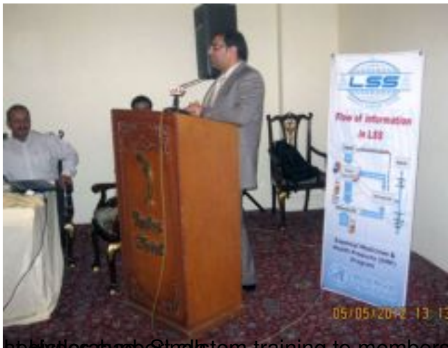
Logistics support system training to members of the People's Primary Health Initiative of Sindh