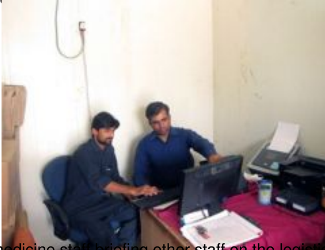
Essential medicine staff briefing other staff on the logistics support system in Quetta