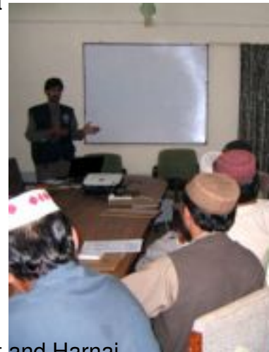
Training on rational use of medicines and the logistic support system in Ziarat and Harnai