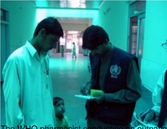
The WHO pharmacist conducting an outpatient interview