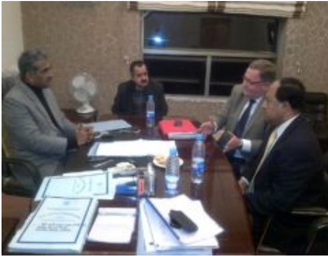
WHO mission staff in a meeting with health authorities to investigate the Tyno toxic cough syrup incident in 2012 which killed more than 50 people in Punjab