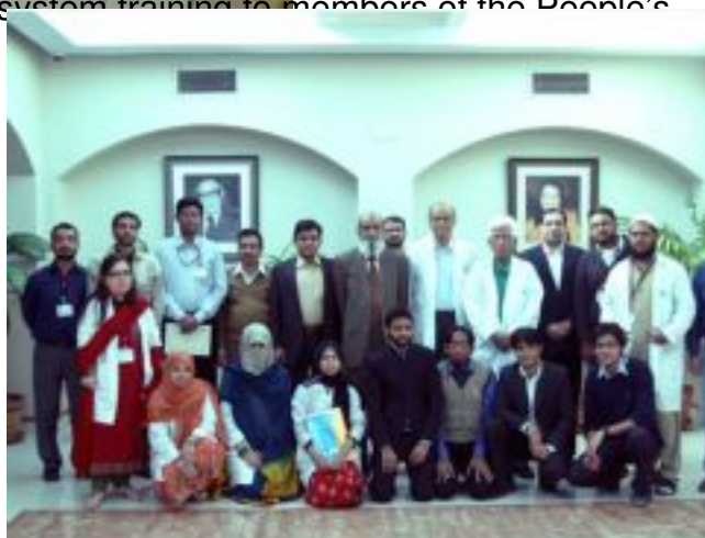
Group photo of participants in logistics support system training at Sindh Institute of