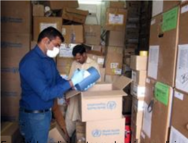
Essential medicines team checking medicine boxes at a warehouse in Quetta