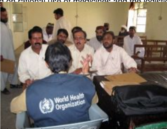
The training lasted two days and took place at the District Health Officer's office