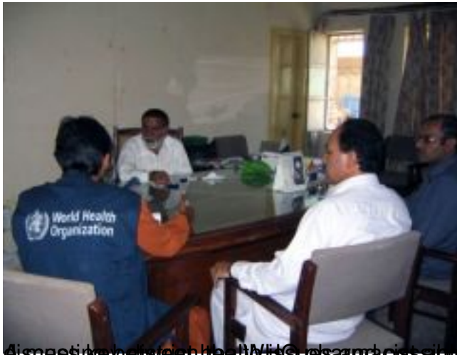
Discussing persistent health issues and possible solutions with District Health Officer in Jafferabad, Sindh, to