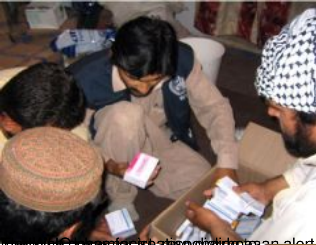
The WHO pharmacist, responding to an alert in Pishin, Balochistan, briefing the health team on