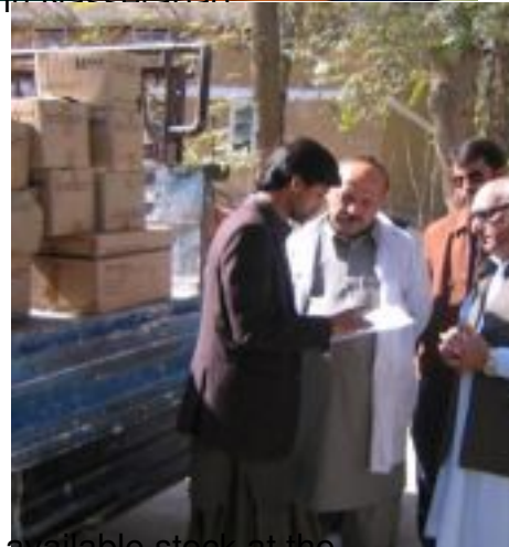
The WHO representative is checking the consumption and checks the available stock at the