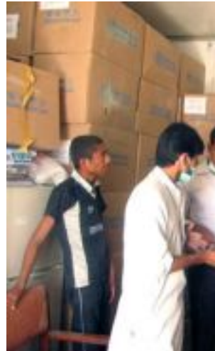
Essential medicines team checking medicine at a warehouse in Quetta