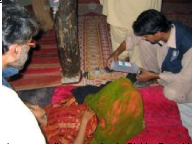
The WHO pharmacist, responding to an alert in Pishin, Balochistan, meeting with patients