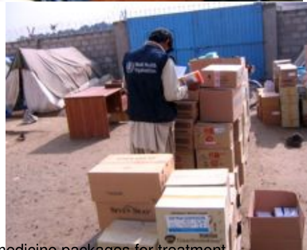
The WHO pharmacist organizing the respiratory infection medicine packages for treatment