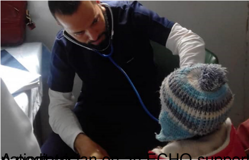
A pediatrician on a WHO-supplied team in the far southwest of Libya checks a young