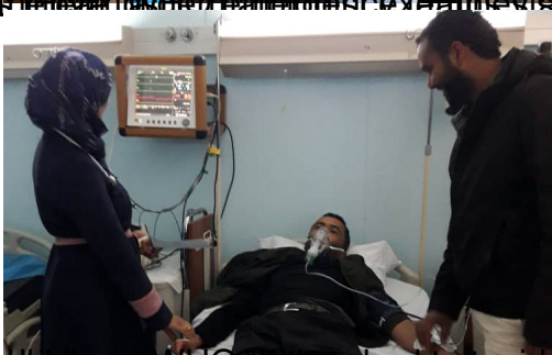
the original WHO mission to provide medical assistance to patients after the suspected outbreak of