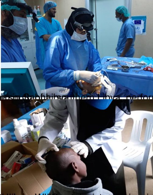
in Sirte, Libya, to help the medical team in Libya perform surgery. ECHO supports several WHO medical