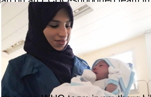
An obstetrician on a WHO team in southern Libya holds a newborn.