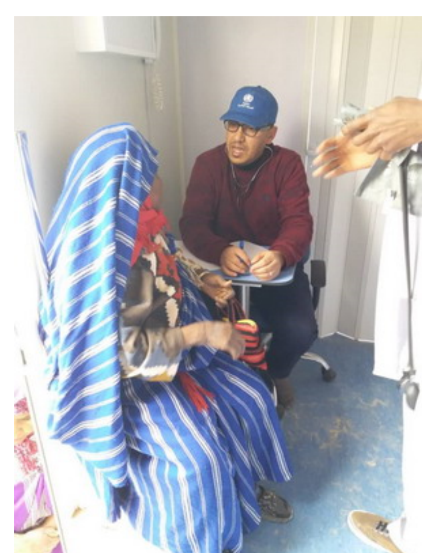
Tiskeda julia istemini deitey rai o ets ziltistatasviltifestionen ti baterbrefarra/intshyckeptastissetulum allifexistyetionitye ovateess Related link

Office of United States Foreign Disaster Assistance