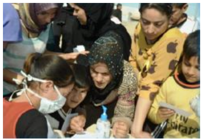
Health services are provided to internally displaced people in camps in Iraq Highlights, 20 October–15 November 2015

A national polio immunization campaign targeting children under 5 was concluded in all Iraqi governorates with a coverage rate of 90%. The 6-day campaign was also implemented in the newly liberated areas of Telkyef, Sinjar, Shikhan and Talafar- districts of Ninewa governorate.