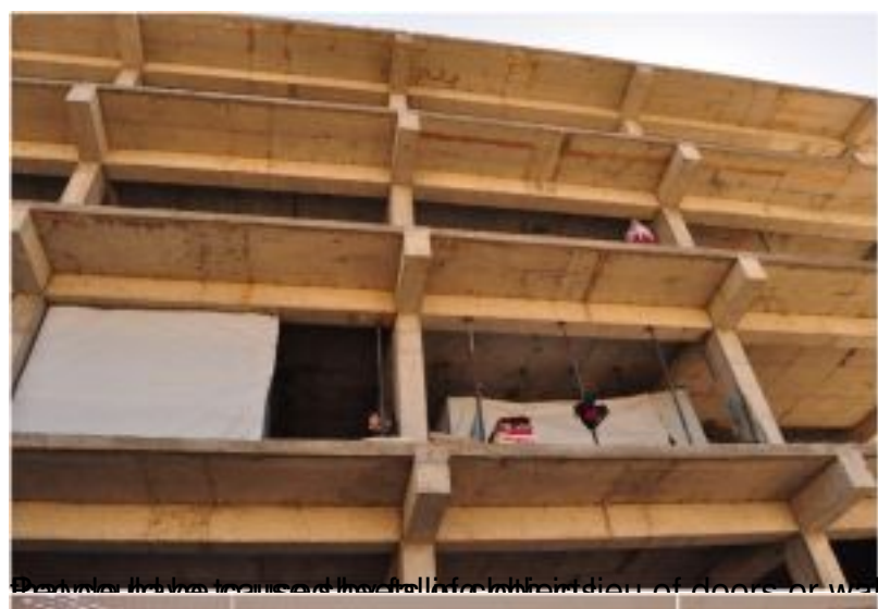
Is to protect their children from injuries