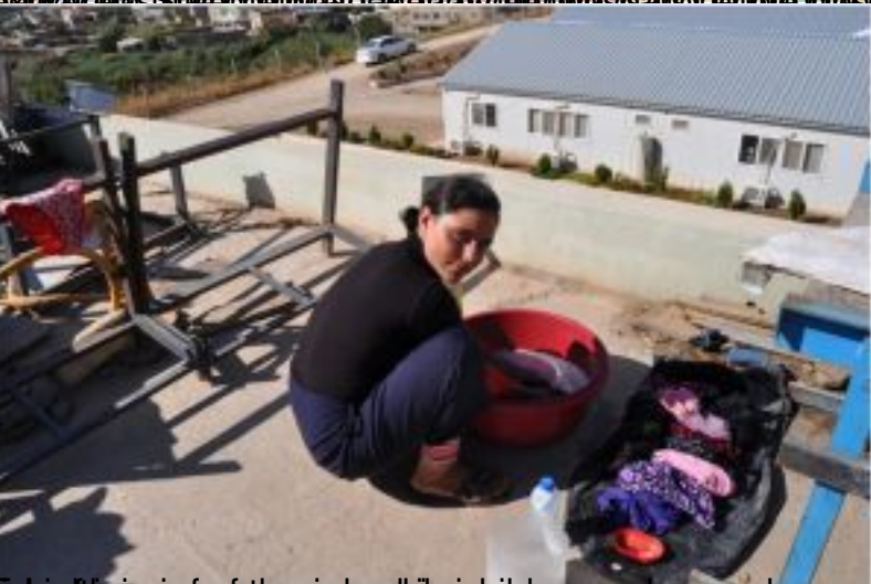
Essleightinguroes of cuturus og ovalhillse ich ill sleems am spacen en hare prænfryndrining batis victides i lyne pærebronde das Klse