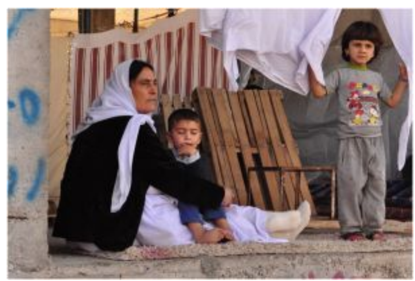
37 families sheltered in an unfinished building within Duhok City.