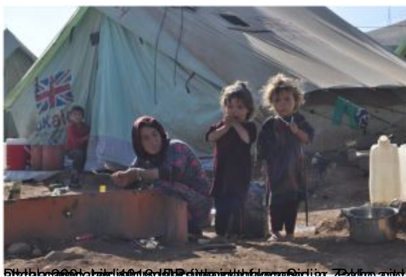
ra bas lle 6 0/koocimæsthvæfrÐaldorki,nistered to