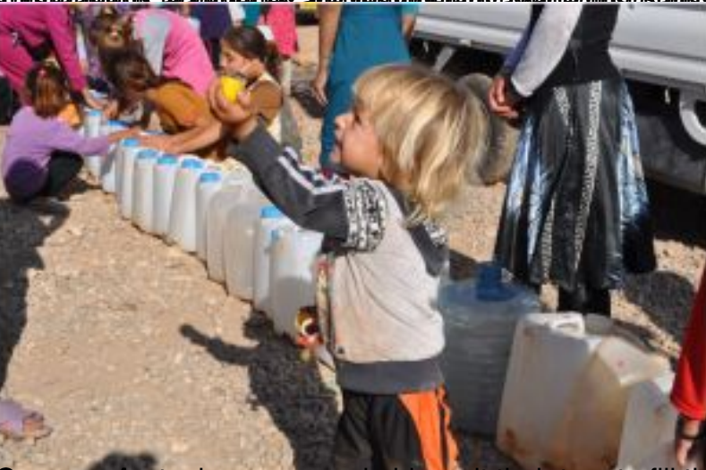
the care pobydangers men and girls wait their turn to fill their water buckets. Water is supplied to