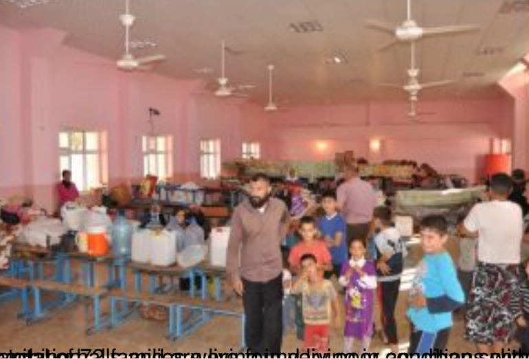
nadilian entition dibeasentoeade Quatekweit je 17, hte palaande