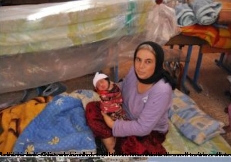
eta je kolod shjedlada i brit. Dbu blodko spodnemen si tridi e s .