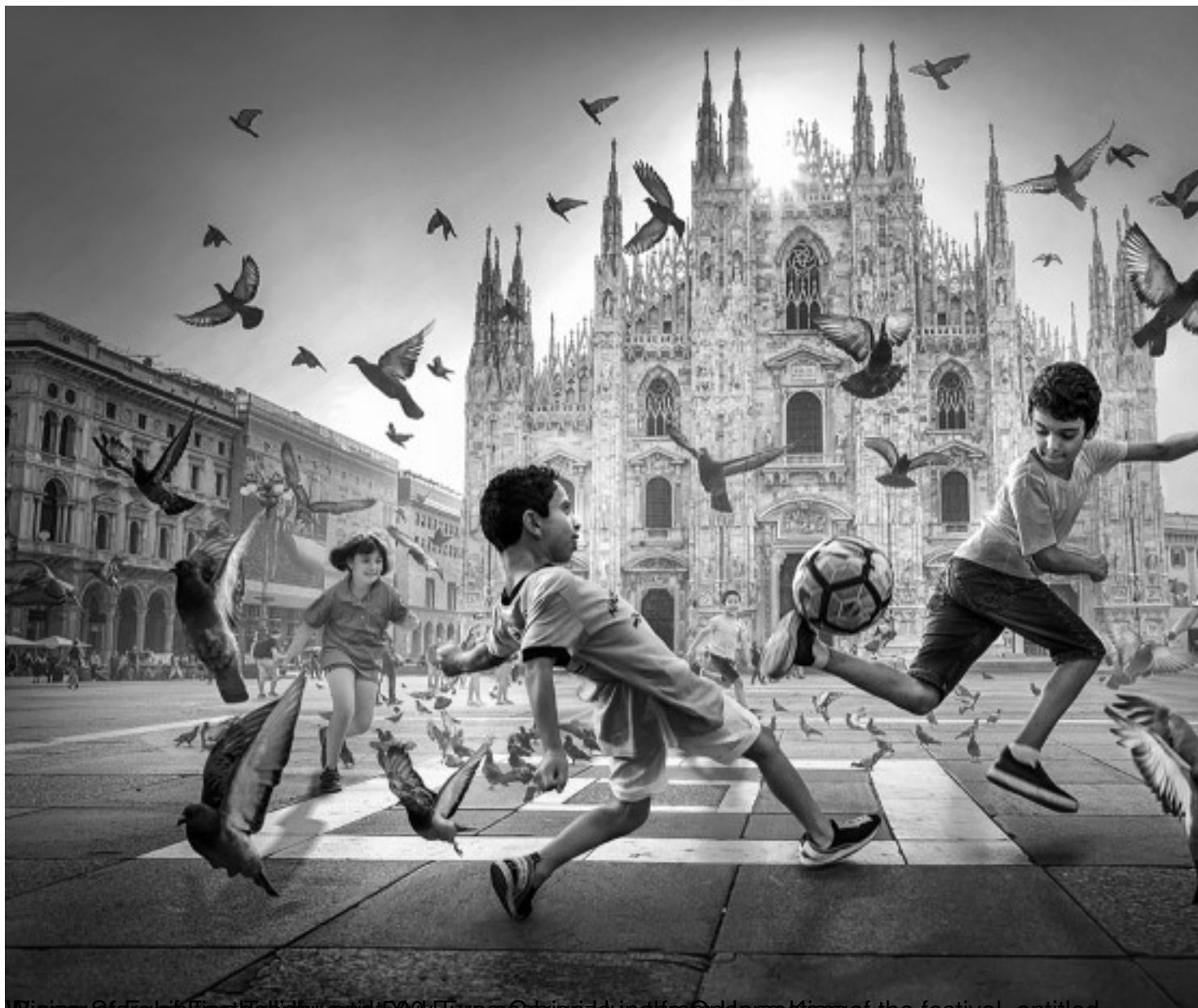
Wising 3fa Exhibition by ams150k Euro King of the festival, entitled