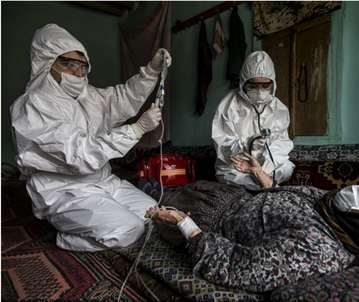
Artist: Serpil Karayal from Turkey. COVID-19 section of the festival, entitled 'Aunt COVID-19' by