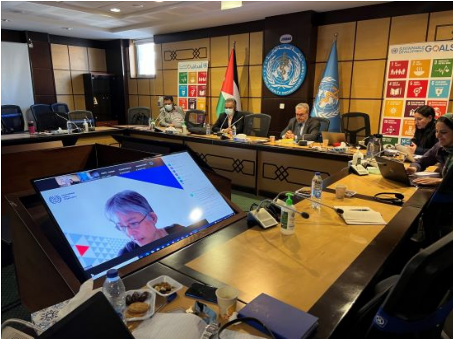
Technical discussions were held by the meeting's participants at CEHA in Amman, Jordan.

Thursday, 19 May 2022 – Occupational health and safety (OHS) and multilateral collaboration at the regional and country level were discussed during a tripartite meeting between the World Health Organization (WHO) country office in the Islamic Republic of Iran, WHO's regional Centre for Environmental Health Action (CEHA), the International Labour Organization (ILO) and the Iranian Ministry of Health and Medical Education and Ministry of Cooperatives, Labour and Social Welfare, held in Amman, Jordan, on 18 May 2022.