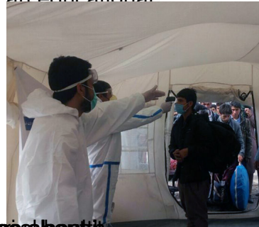
in Iraq, WHO worked with the Ministry of Health to create an educational