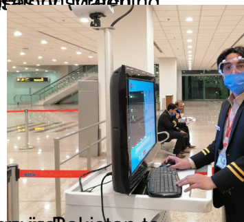
in Iraq, WHO worked with the Ministry of Health to create an educational