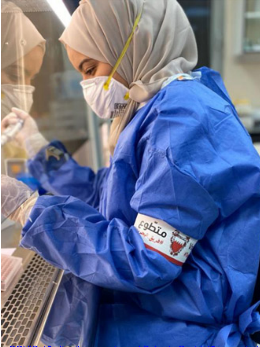
COVID-19 situation reports and Bahrain Covid-19 case study