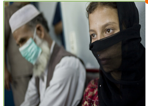
Globally, 700 000 women die from tuberculosis every year; this disease kills more women than do all causes of maternal mortality combined. Case-fatality rates seem to be higher in women than in men, and women are more often diagnosed with extra pulmonary tuberculosis. Lancet, June 12, 2010.