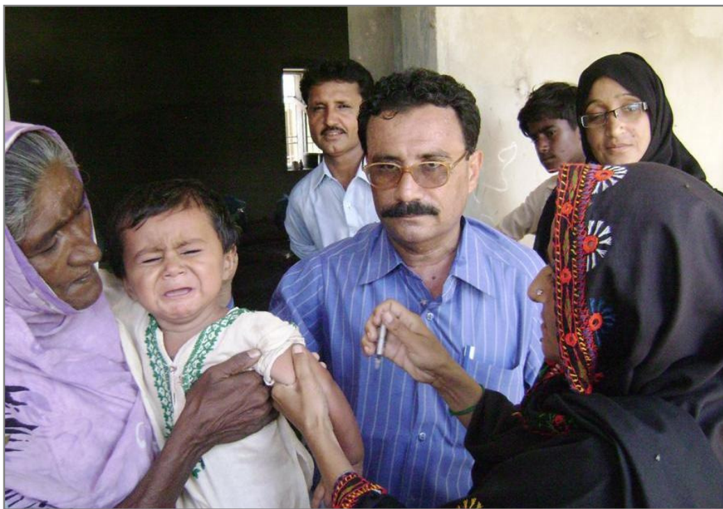
Vaccination campaign at an IDP camp at Government Girls High School in Taluka Sehwan, Jamshoro district, Sindh province.