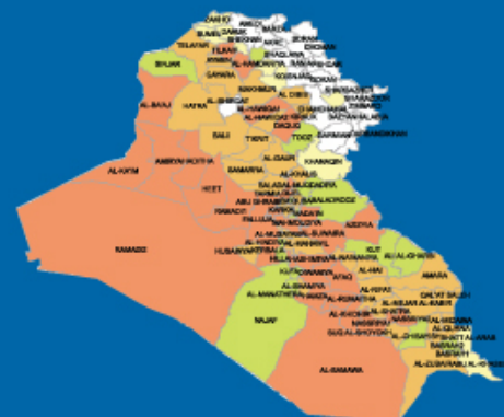
Reported Measles Cases by International Week Iraq, first 36 weeks of 2009