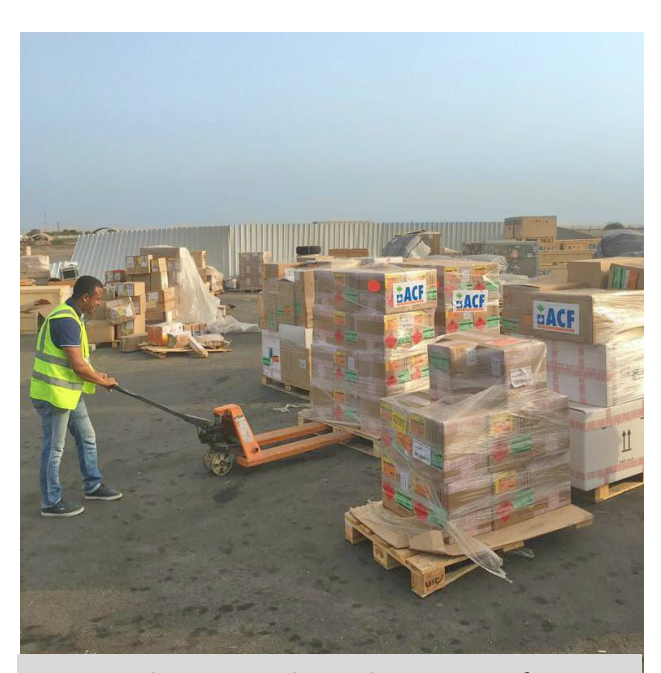
Logistic Cluster coordinated transport of 152 mt relief for partners, Yemen.

WHO has finished loading trucks containing 70 tonnes of cholera treatment supplies which arrived at Sana'a airport last week.