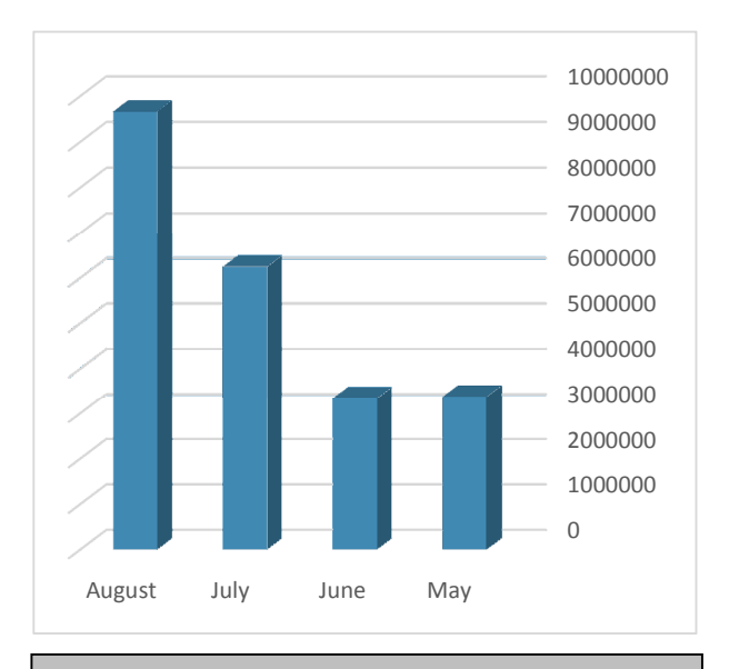
The overall WASH beneficiaries by month

Training of hygiene promotors and health facility workers on key cholera awareness and prevention messages took place in 12 districts in 8 governorates. Almost 2.4 million people were reached by partners with cholera key messages, through household visits, public events (including schools and mosques) and through mass media in 170 districts in 19 governorates. WASH partners reached almost 370,000 people with basic or consumable hygiene kits in 74 districts in 13 governorates for households, schools and food vendors.