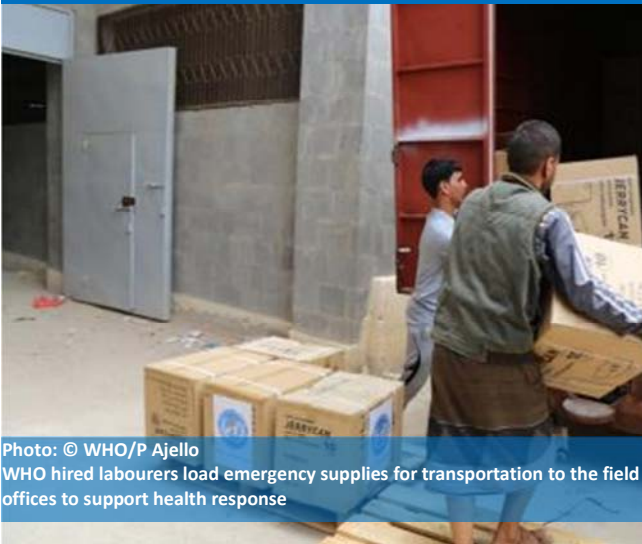
WHO hired labourers load emergency supplies for transportation to the field offices to support health response