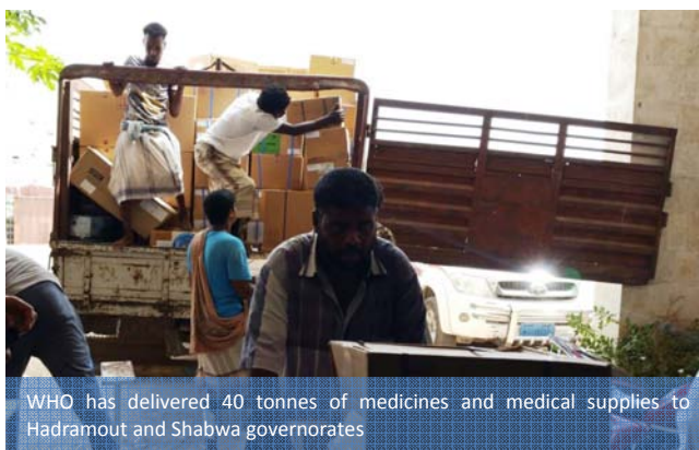
WHO has delivered 40 tonnes of medicines and medical supplies to Hadramout and Shabwa governorates