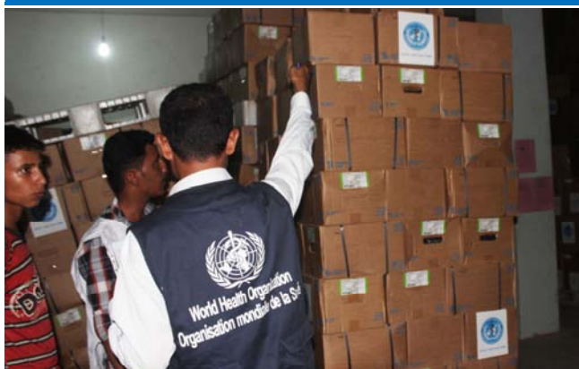
WHO has delivered life-saving medicines and IV fluids to the warehouse of the Public Health Office in Hajjah Governorate