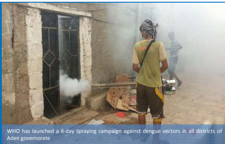
WHO has launched a 6-day spraying campaign against dengue vectors in all districts of Aden governorate