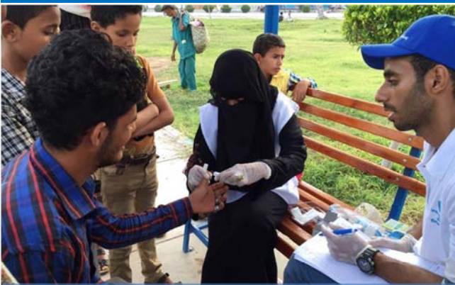
WHO/Yemen marked World Health Day by conducting health awareness events in Sana'a, Al Hudaydah and Aden governorates