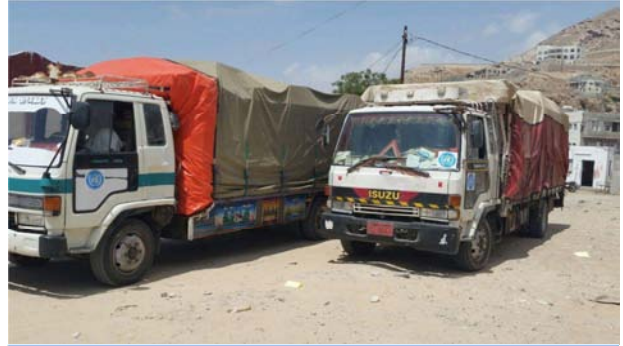
WHO delivered emergency medicines and 5000 vials of insulin to the Public Health Office in Hadramout governorate.