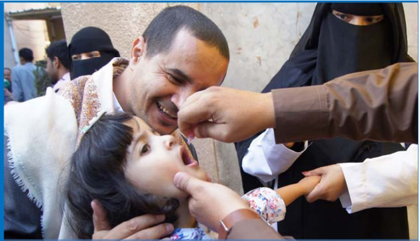
A house-to-house polio immunization campaign reached more than 4.5 million children