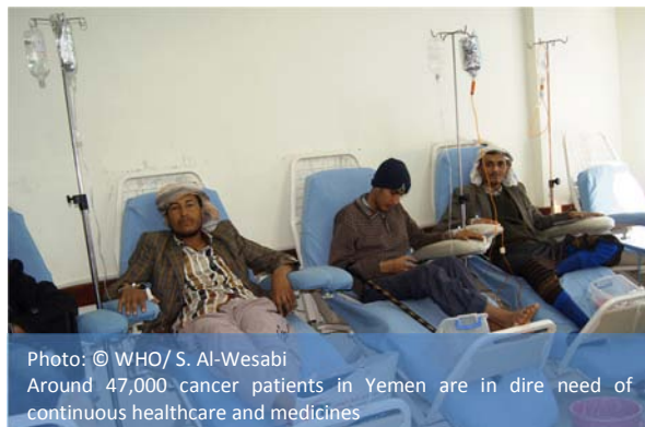
Around 47,000 cancer patients in Yemen are in dire need of continuous healthcare and medicines