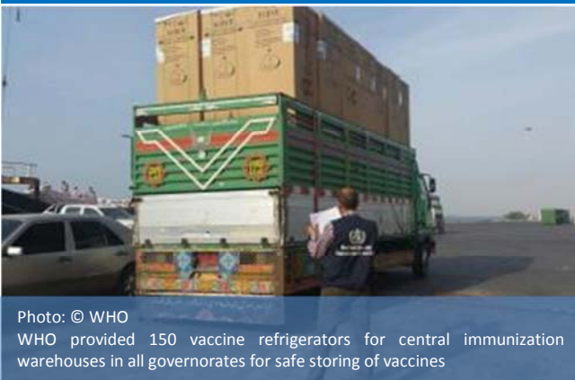
WHO provided 150 vaccine refrigerators for central immunization warehouses in all governorates for safe storing of vaccines