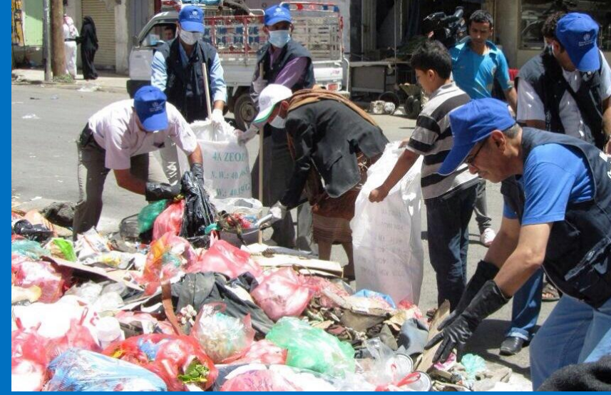
To reduce the risk of hygiene-related communicable diseases, WHO teams participate in a three-day cleaning and awareness campaign in selected neighborhoods in Sana'a