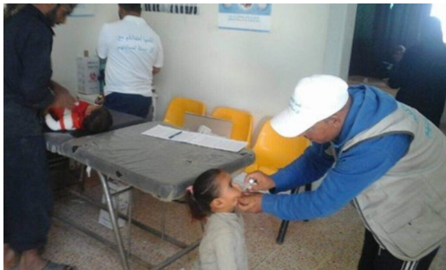
mOPV2 and IPV vaccination in Karama fixed center, 35 km west of Raqqa.