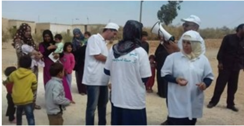
Five vaccination teams from Hama reached more than 4,000 children between 0-59 months with mOPV2 in Debsi Afnan, West Rural Raqqa. The area has not been accessible for the last 18 months.