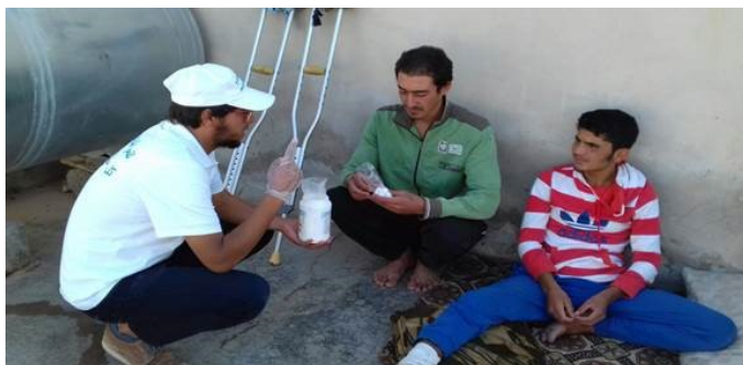
Aqua Tabs distribution in Salhabiyah village 28 km west of Raqqa city