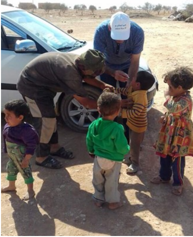
A total of 47 new villages in Debsi Afnan, West Rural Raqqa were reached in the second round of the immunization campaign.