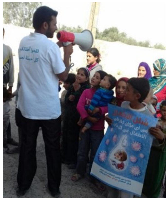
UNICEF delivered messages around safe use of Aqua Tabs that were distributed to families during the campaign.