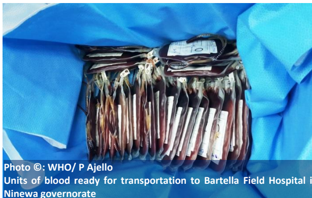
Units of blood ready for transportation to Bartella Field Hospital in Ninewa governorate