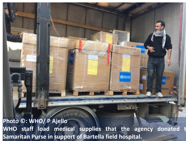
WHO staff load medical supplies that the agency donated to Samaritan Purse in support of Bartella field hospital.