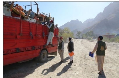
Vaccination teams supported by WHO immunize children against polio at the Torkham border