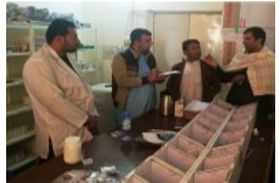
WHO assessment team in Spinboldak District Hospital in Kandahar