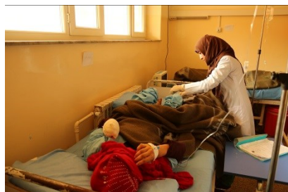
Nurse attends to a patient at the WHO-supported trauma care unit in Kunduz