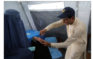
WHO supplied Pneumonia Kits, Basic Health and Trauma kits A+B for the IOM transit center for returnees in Torkham to support health response. Here a child receives a polio vaccine at the transit center.