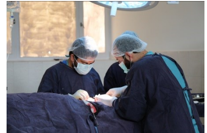
Surgeons operate on a patient at the WHO-supported trauma care unit in Kunduz in November