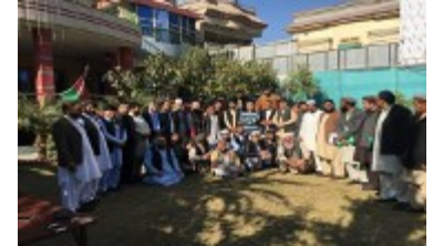
Training on WASH and environmental health in health facilities